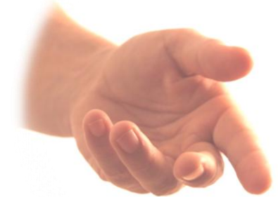
God's helping hand

Grove Street Christian Church (Disciples Of Christ)