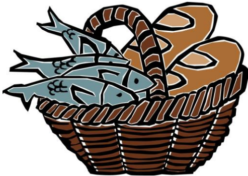
Fishes and Loaves

Thanks to all who help. Grove Street Christian Church is dedicated to many important and worthy causes especially feeding the hungry. You'll often find young people asking for donations for this admirable cause, during coffee hour. One can hear announcements in church on most Sundays advocating this wonderful charity. If food is procured through the Twin Cities Community Outreach program, just one of our dollars can buy 14 lbs of food for a hungry family. For more information on how you can make a difference in the life of someone in need, please see our pastor.